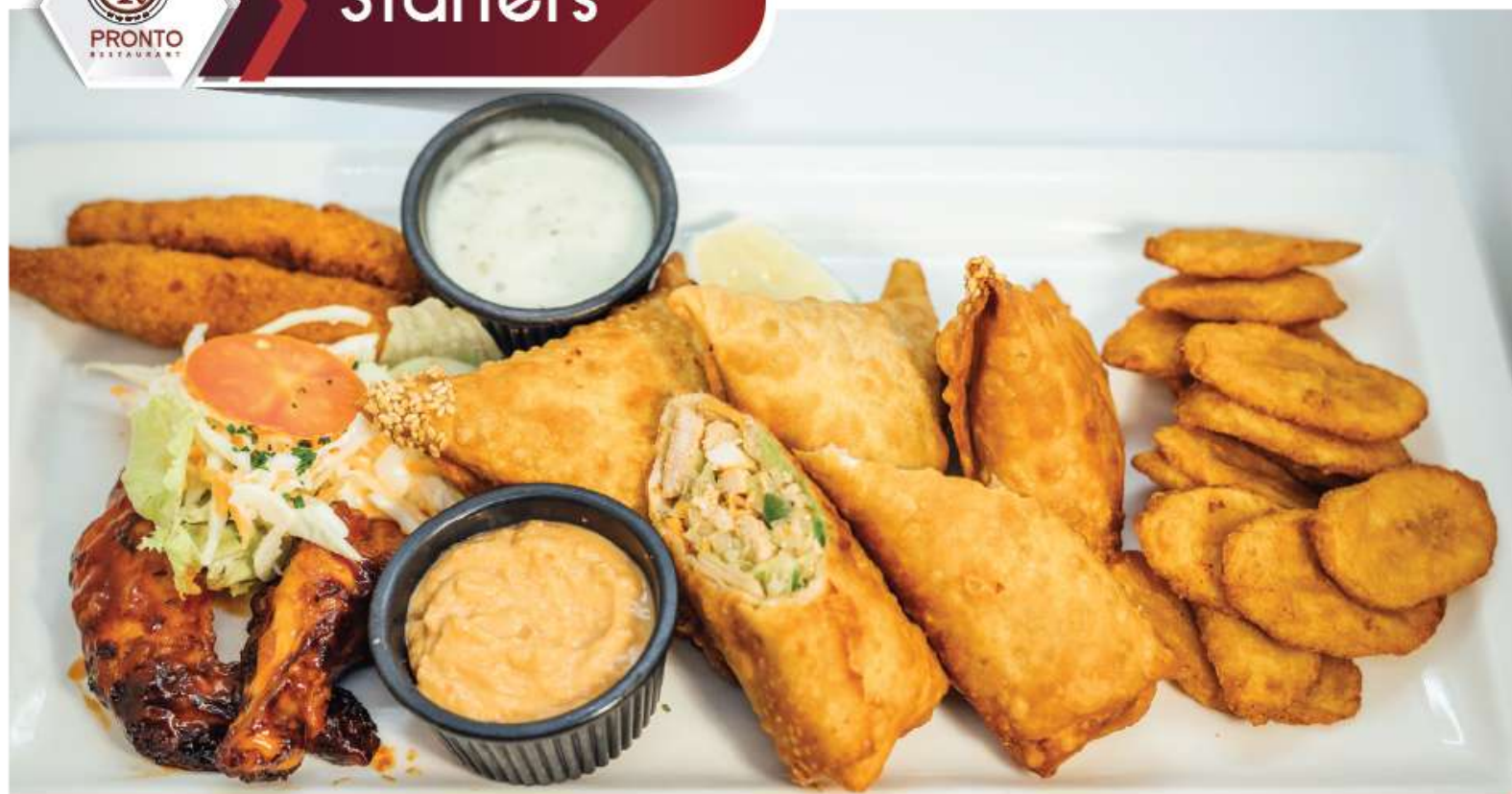
Mixed Platter 980/-