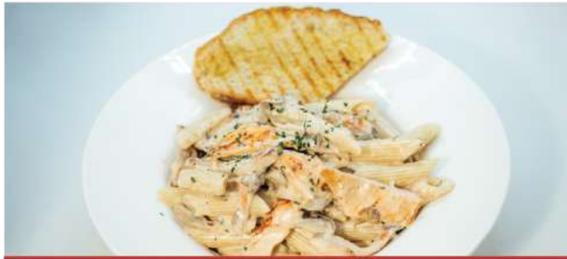
Chicken Alfredo Pasta 1000/- Penne in creamy sauce, mushroom, chicken & parmesan cheese