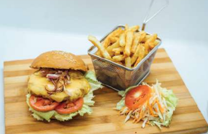
Classic chicken/ beef/ veg burger 980/- Chicken/ beef/ vegetable, lettuce, tomato and caramelized onion.