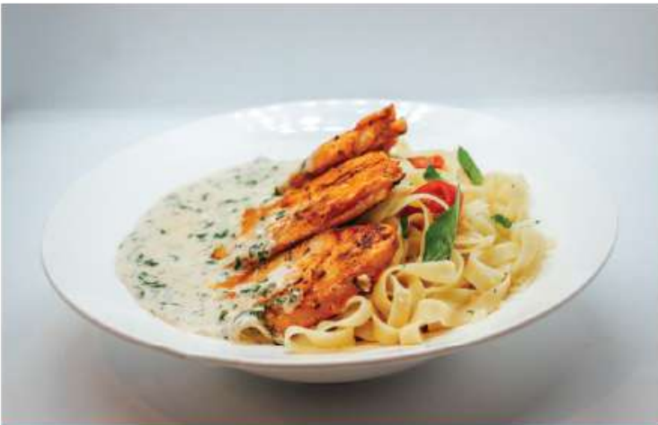
Tuscan chicken pasta 980/= Fettuccine pasta with chicken in tuscan sauce with spinach & sun-dried tomato.