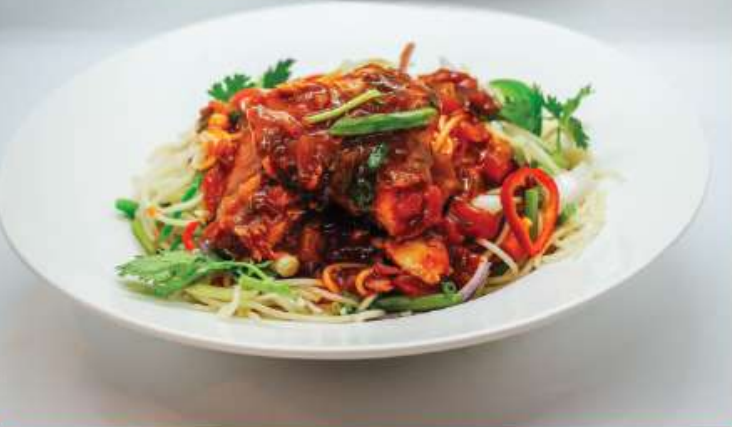
Yakisoba ramen 950/= Ramen noodles, vegetables topped with fish or chicken with a touch of sesame.