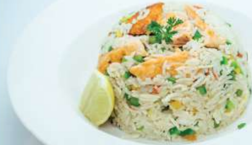
Salmon rice 1050/-