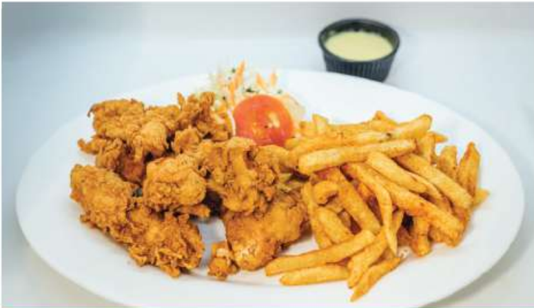
Crispy chicken 1000/- Breaded chicken strips, deep fried served with coleslaw and honey mustard.