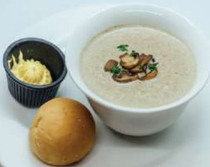
Cream of Mushroom soup 380/-