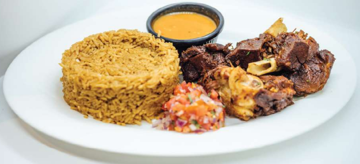
Arosto with pilau 1000/-