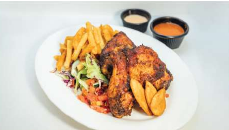
Carribbean royal chicken 1200/=

Roasted chicken lemon & herb periperi marinade, chips, mix vegetables and periperi sauce