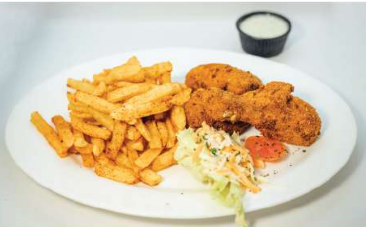
Chicken merryland 1000/-

Grilled chicken in sweet chilly sauce emulsion.