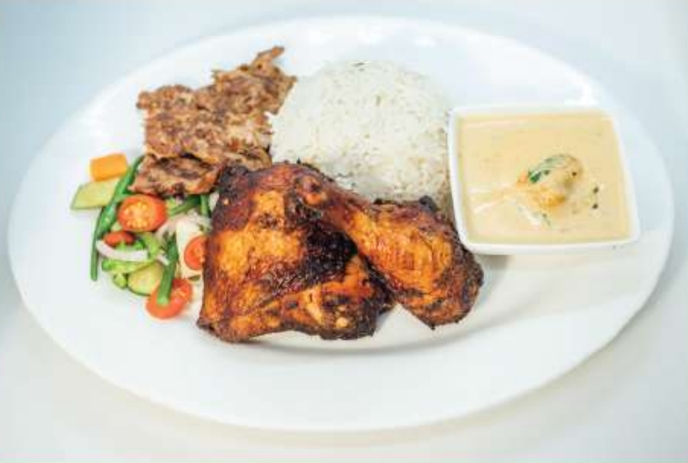
Trixie meal 1300/=

A combination of royal chicken, grilled beef and fish curry served with steamed vegetables