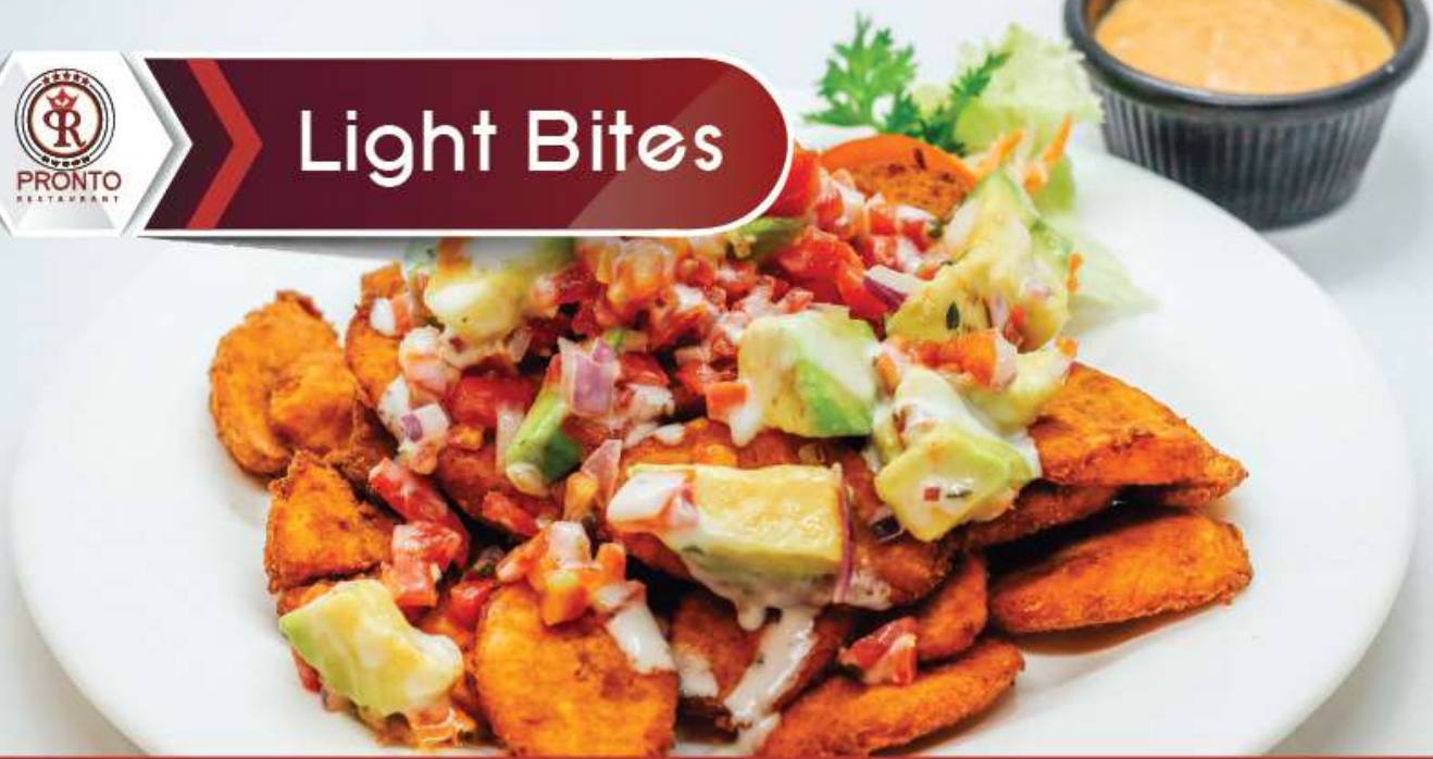
Upgraded plantain 650/-