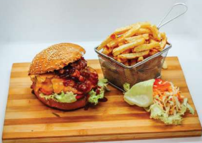
Mexican burger 980/- Chicken/beef, cheddar cheese, green pepper, white onion, tangy salsa, chilli mayo & jalapenos in a bun.