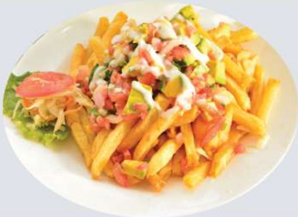
Upgraded Fries 500/-