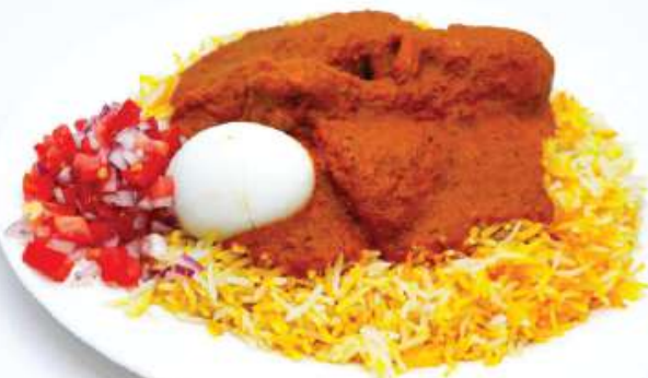
Biryani Chicken 750/-