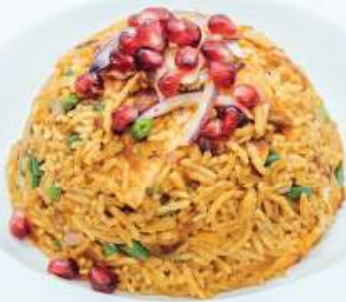
Nasi Goreng Chicken rice 850/-