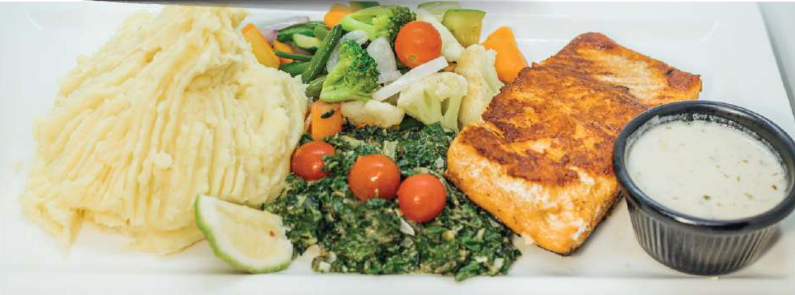
Grilled Norwegian salmon 2200/=

Grilled salmon, olive oil lemon marinade, creamy spinach, sauted vegetables, mashed potato and caper sauce.