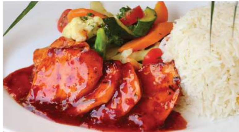
Sweet chilly chicken 1100/-

Marinated spicy chicken on bone served with garden salad, salsa & ranchero sauce