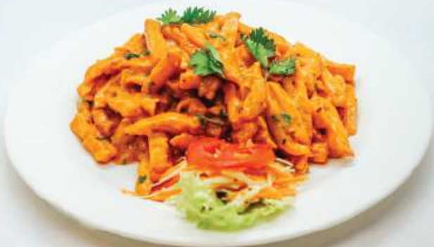
Masala Fries 500/-