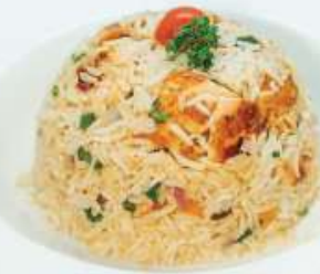
Chicken rice 850/-