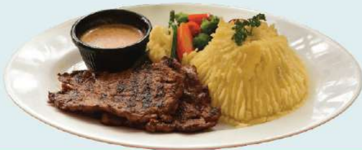
Grilled beef fillet steak 1100/- Grilled prime fillet steak, vegetables served with sauce of your choice (Mushroom sauce, pepper sauce or gravy sauce).