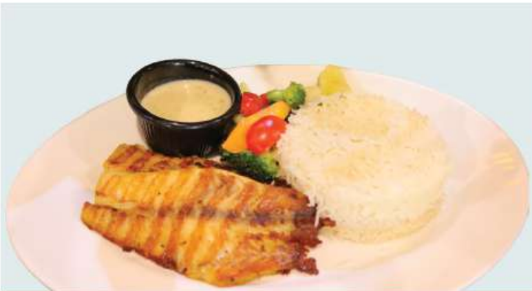
Grilled tilapia 1150/-

Grilled salmon, olive oil lemon marinade, creamy spinach, sauted vegetables, mashed potato and caper sauce.