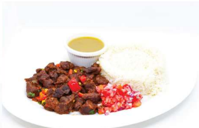
Beef fry with rice 850/- Fried beef with rice.