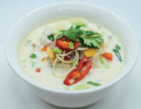
Chicken/Fish/Veg noodle in coconut milk soup 380/-