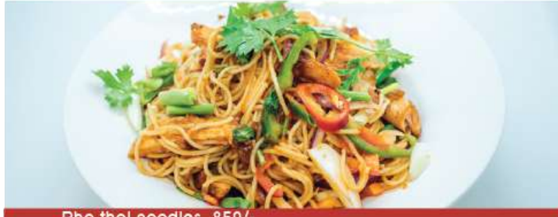
Pha thal noodles 850/- Mushroom, chicken, assorted vegetables in yam chilly sauce.