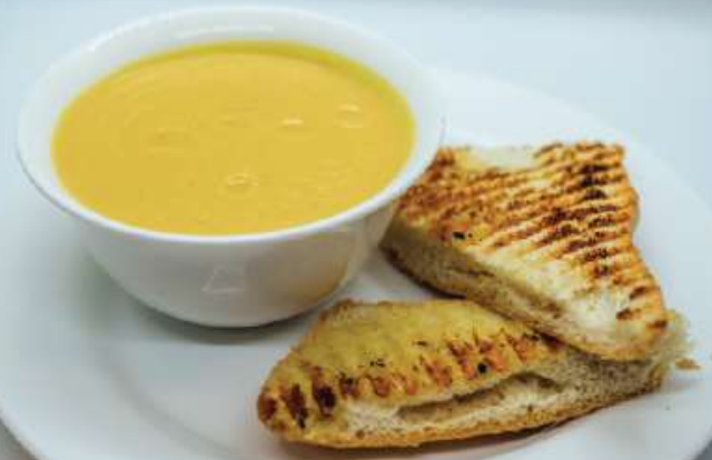
Carrot & Ginger Soup 380/-