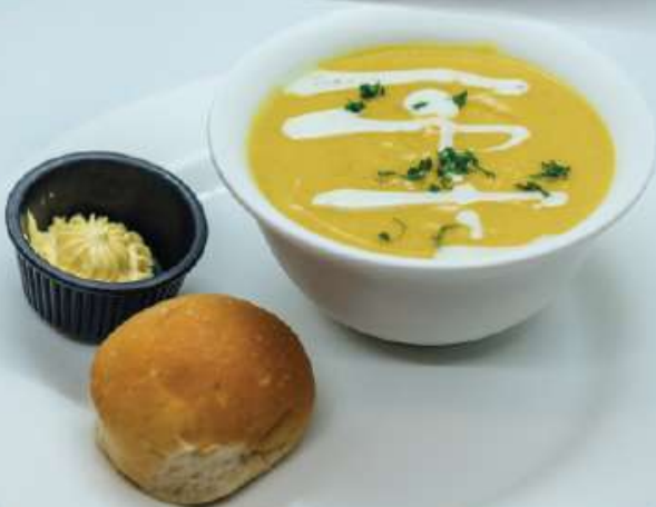
Cream of Pumpkin & Butternut Soup 380/-