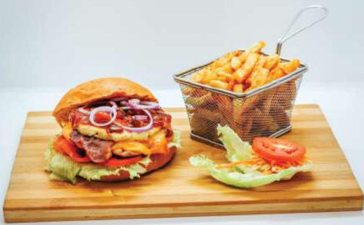
Hawaiian chicken burger 1000/- Pineapple, onions, tomatoes, Macon, bbq sauce, cheddar cheese, grilled chicken in a bun.