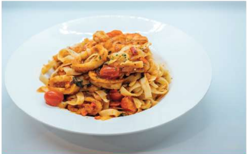
Sea food pasta 1100/= Fettuccine pasta, tossed with prawns, calamari & fish