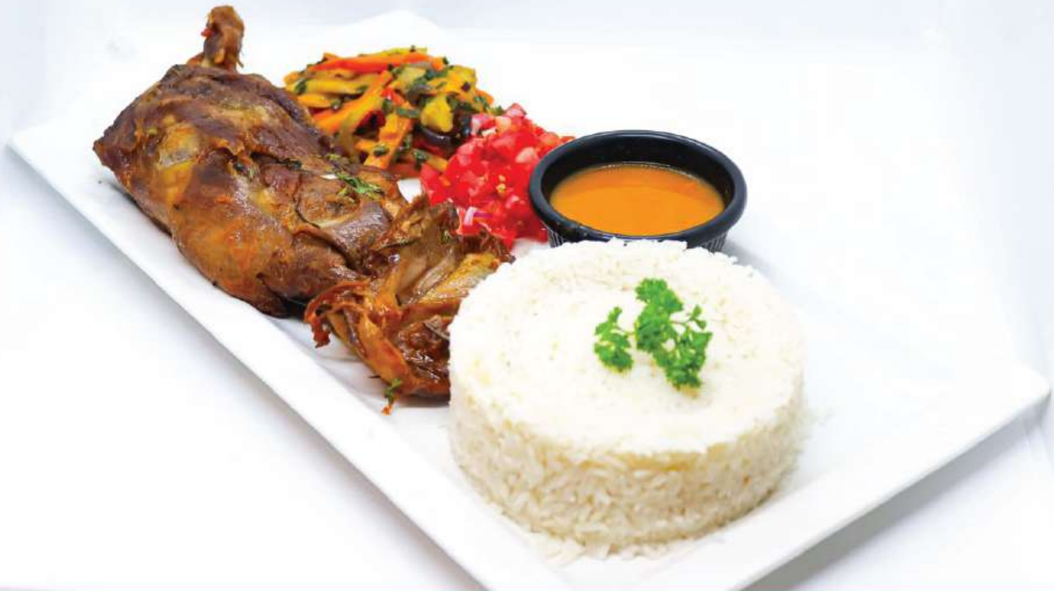
Dailo with rice 1300/-