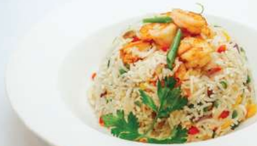
Prawns rice 950/-