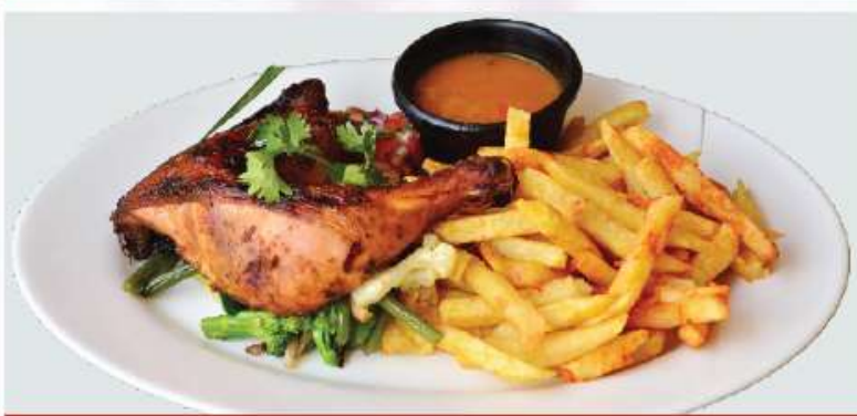
Chicken fry 980/- Marinated chicken leg, oven roasted served with chips & salsa.