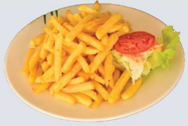
French Fries 300/-