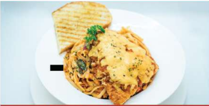
Chicken parmesan pasta 1050/= Breaded chicken topped with tomato sauce & cheese on linguine pasta