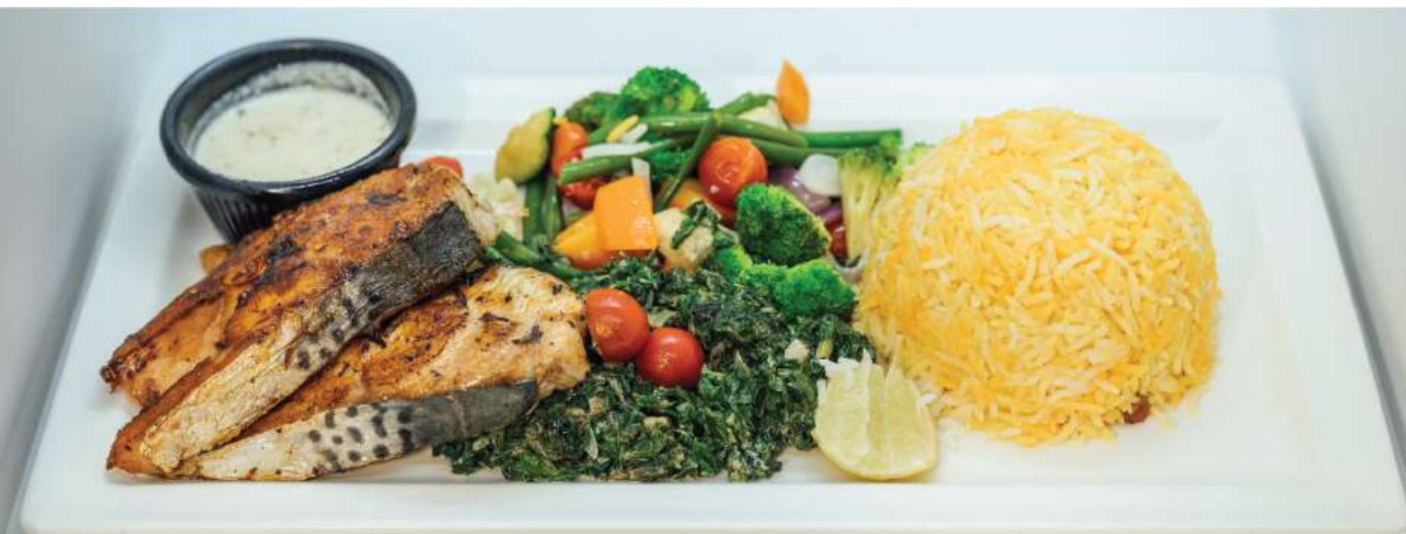
Malay king fish 1600/=

Fillet tilapia cubes in creamy curry sauce