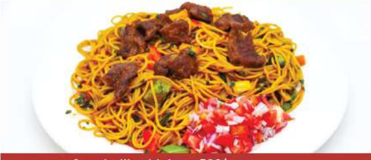
Spaghetti saldato 500/-