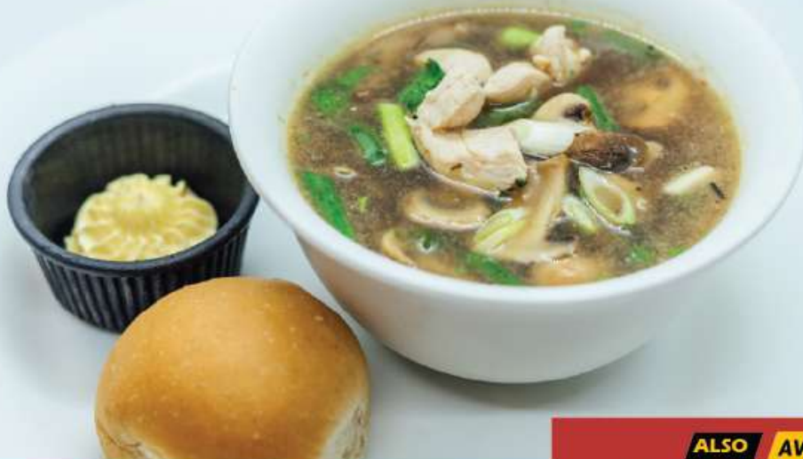
Chicken and Mushroom Soup 380/-

ALSO AVAILABLE Clear mushroom soup 380/-