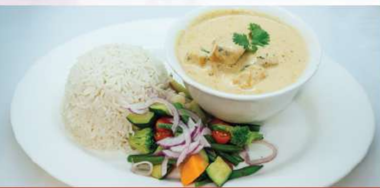
Chicken curry 1000/- Chicken cubes in creamy curry sauce