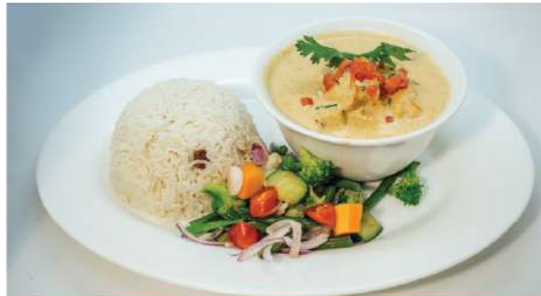
Fish Curry 1150/-

Well marinated grilled fresh tilapia fillet served with vegetables & capers sauce.