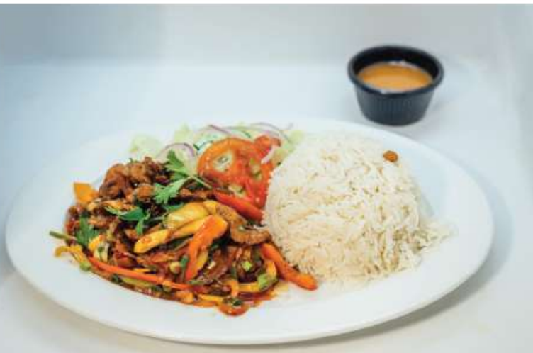
Beef stir fried 1100/- Grilled julienne of beef sauted with vegetables