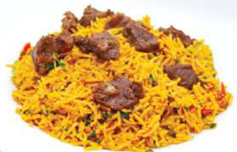
Rice saldato 500/-