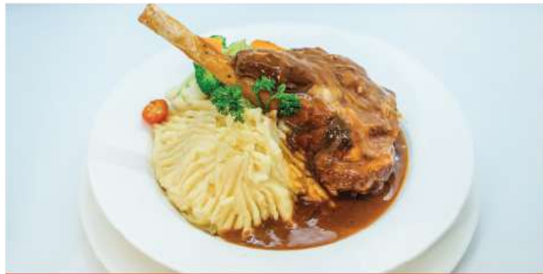
Lamb shank 1350/- Slow braized lamb shank in our special sauce