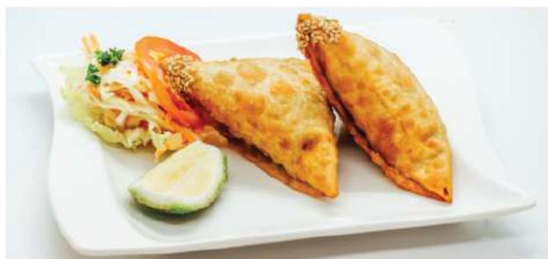
A pair of samosa beef/chicken 250/-