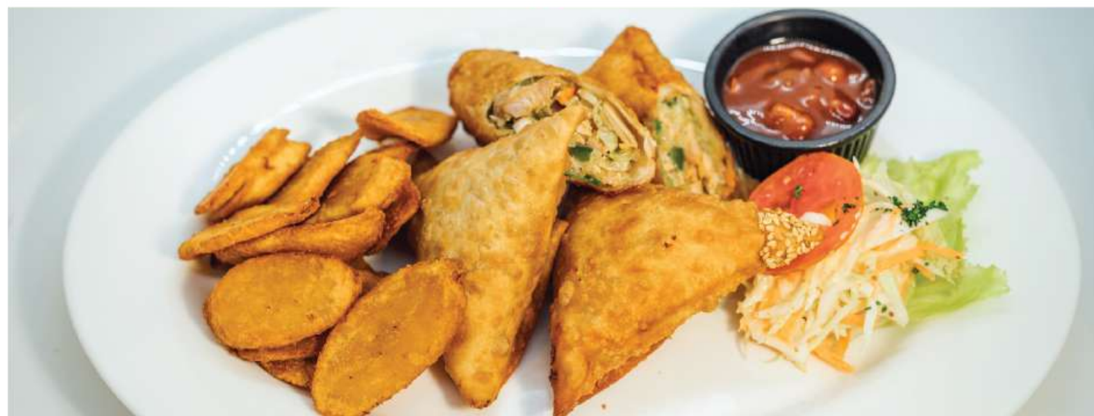
Pronto Mini Platter 550/-