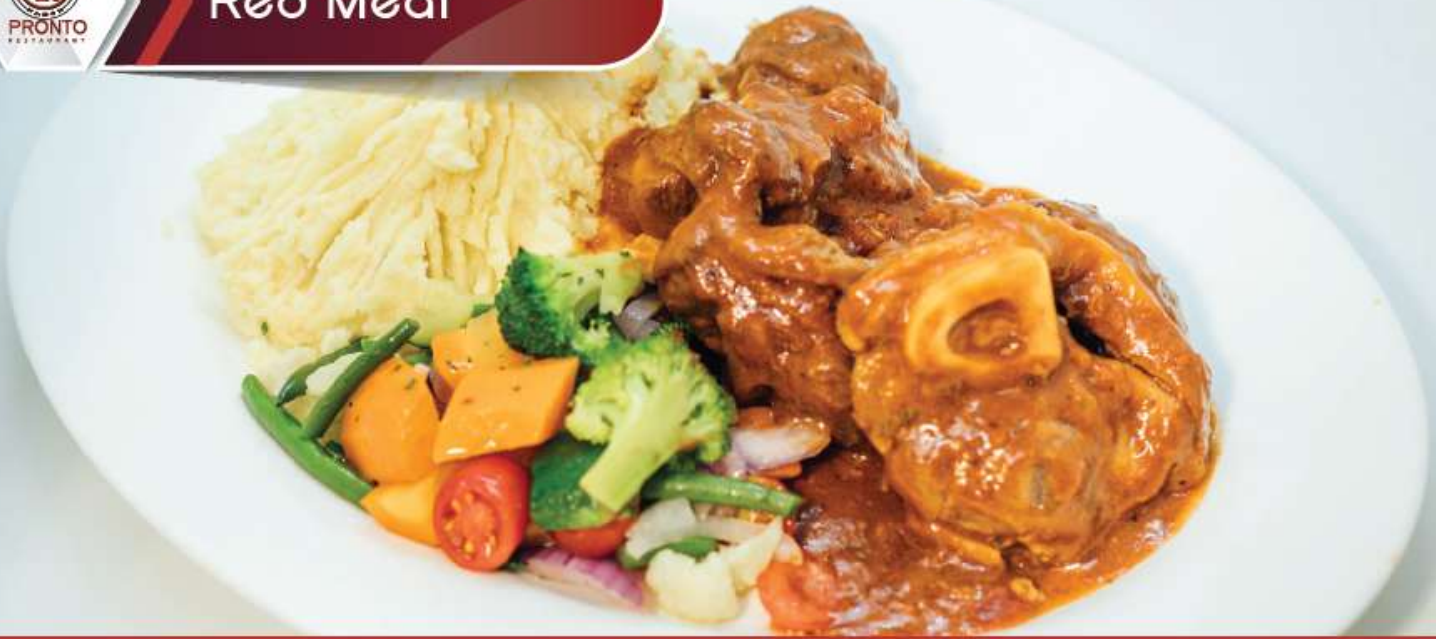
Ossobucco 1150/- Braised beef in piquante sauce.