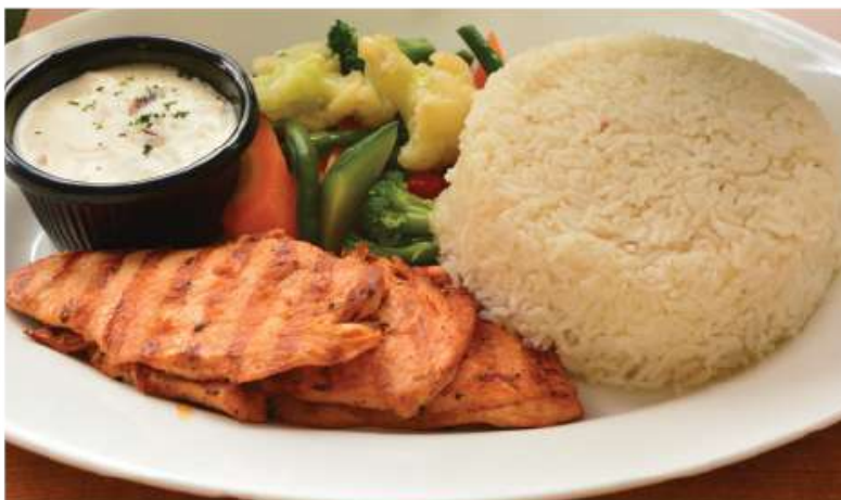
Grilled chicken breast 1070/- Tender juicy grilled chicken breast. steamed vegetables served with sauce of your choice (mushroom sauce, pepper sauce or gravy sauce)