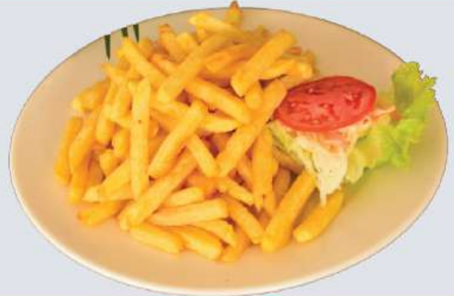
French Fries 300/-