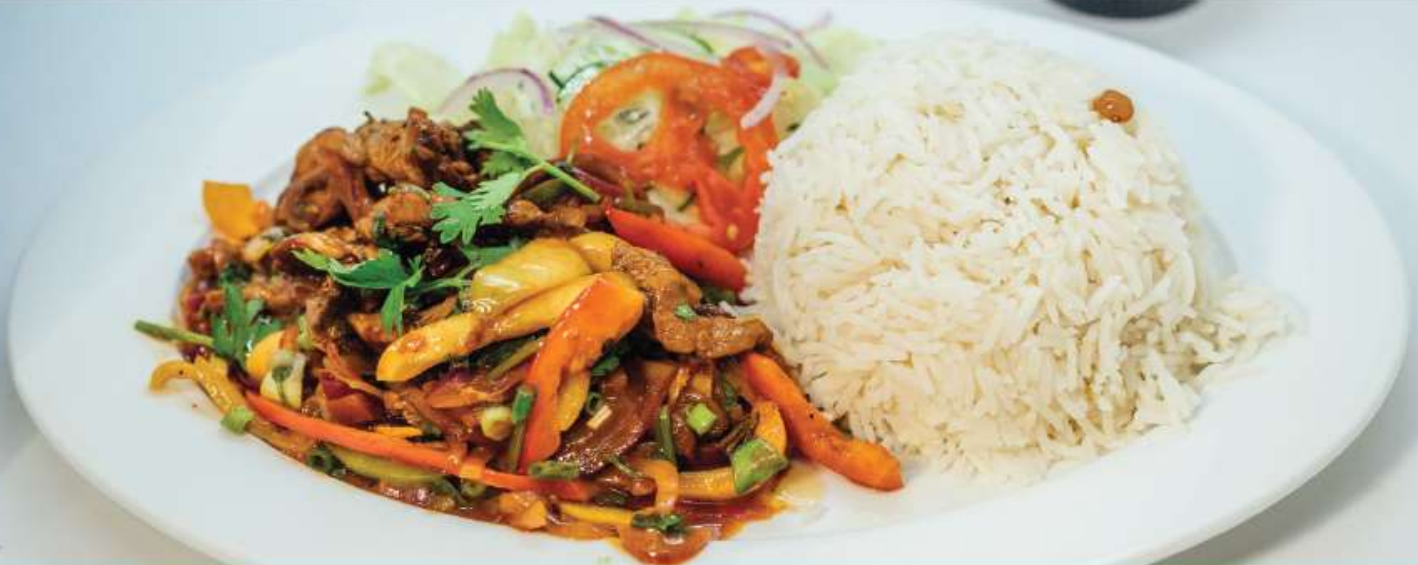
Beef stir fried 980/= Grilled julienne of beef sauted with vegetables