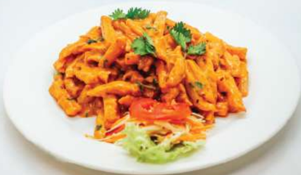
Masala Fries 450/-