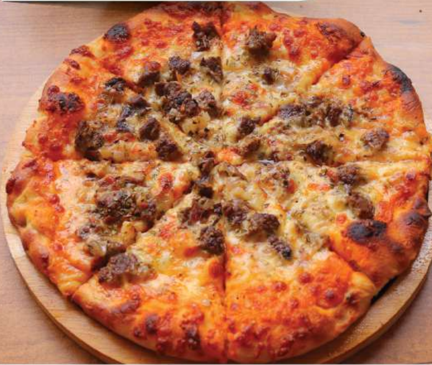
Beef steak pizza