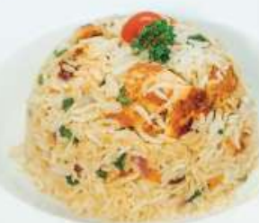
Chicken rice 850/-