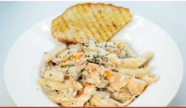
Chicken Alfredo Pasta 980/= Penne in creamy sauce, mushroom, chicken & parmesan cheese