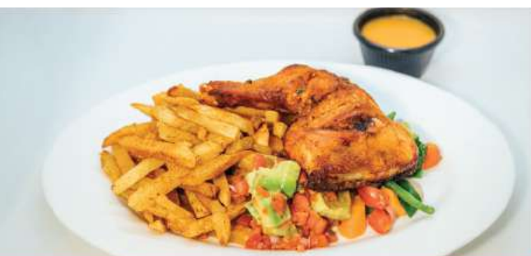
Chicken fry 980/- Marinated chicken leg. oven roasted served with chips & salsa.