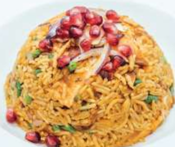
Nasi Goreng Chicken rice 850/-