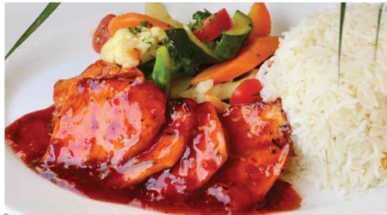
Sweet chilly chicken 1100/-

Marinated spicy chicken on bone served with garden salad, salsa & ranchero sauce