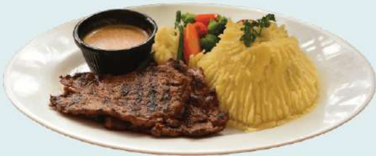
Grilled beef fillet steak 1080/- Grilled prime fillet steak, vegetables served with sauce of your choice (Mushroom sauce, pepper sauce or gravy sauce).