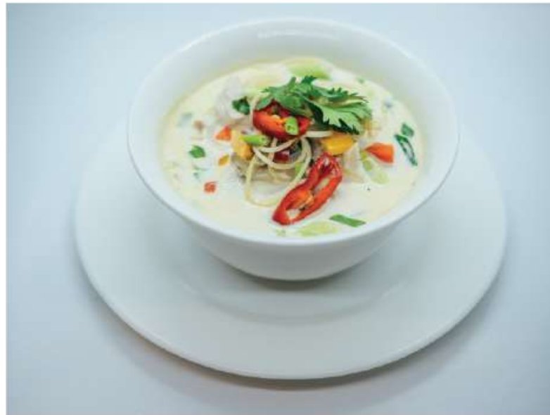
Chicken/Fish/Veg noodle in coconut milk soup 350/-