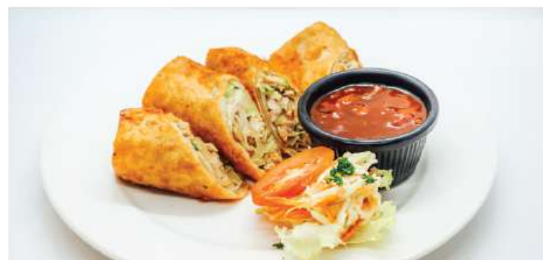
Chicken Spring Rolls 350/-