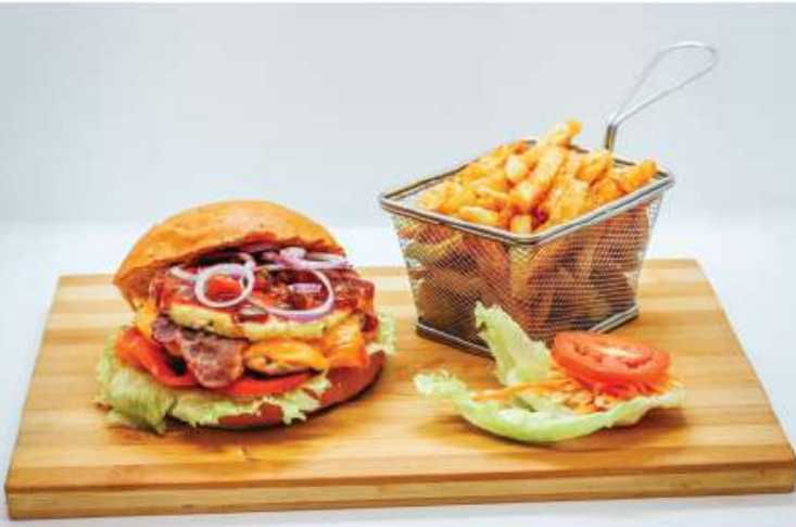
Hawaiian chicken burger 980/- Pineapple ring, macaron, BBQ sauce, cheddar cheese, grilled chicken in a bun.