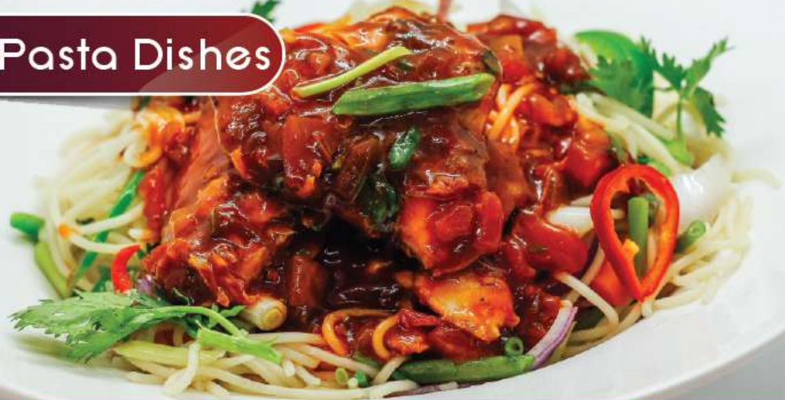
Yakisoba ramen 950/= Ramen noodles, vegetables topped with fish or chicken with a touch of sesame.