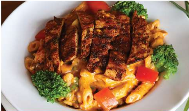
Chipotle chicken pasta 1000/- Penne or spaghetti in spicy sauce, garden peas, chicken & parmesan cheese