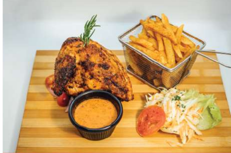
Periperi chicken 1080/=

A combination of royal chicken, grilled beef and fish curry served with steamed vegetables