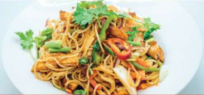
Pha thal noodles 850/- Mushroom, chicken, assorted vegetables in yam chilly sauce.