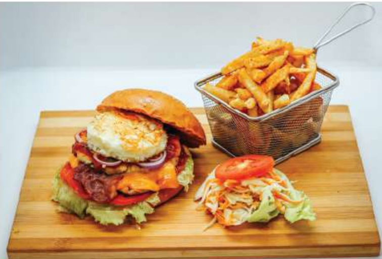
Aussie chicken burger 1000/- BBQ chicken, grilled pineapples, egg, lettuce, tomato, cheddar cheese and ranch aioli.