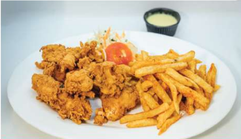
Crispy chicken 980/- Breaded chicken strips. deep fried served with coleslaw and honey mustard.