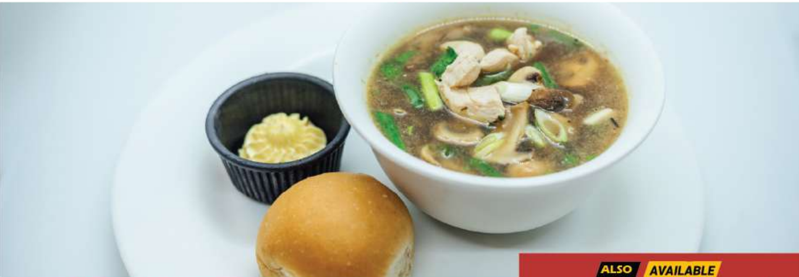
Chicken and Mushroom Soup 350/-