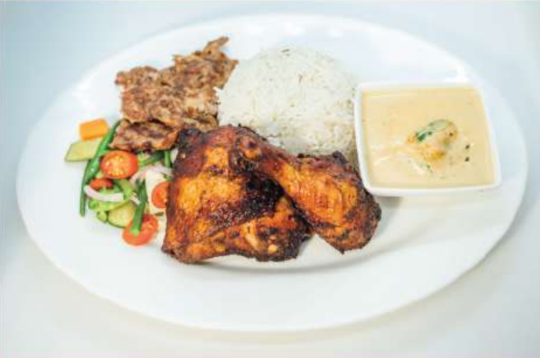
Trixie meal 1280/=

A combination of royal chicken, grilled beef and fish curry served with steamed vegetables