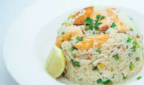
Salmon rice 850/-