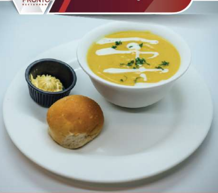
Cream of Pumpkin & Butternut Soup 350/-