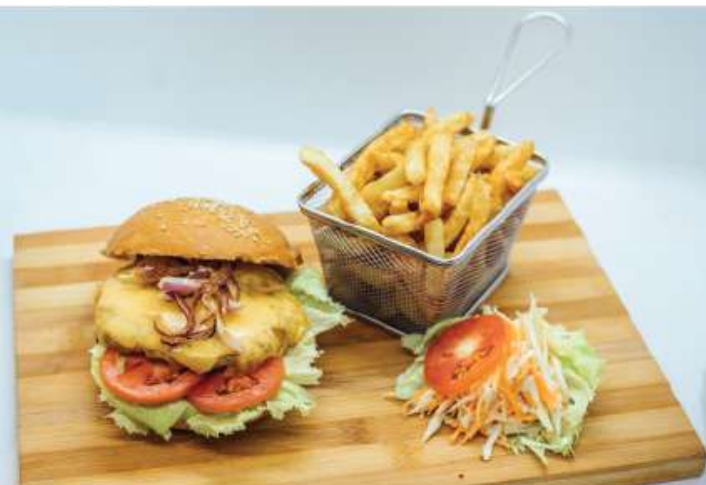
Classic chicken/ beef/ veg burger 980/- Chicken/ beef/ vegetable, lettuce, tomato and caramelized onion.