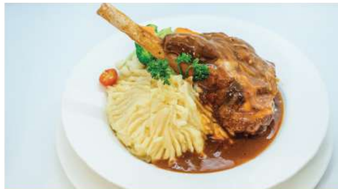
Lamb shank 1080/- Slow braized lamb shank in our special sauce