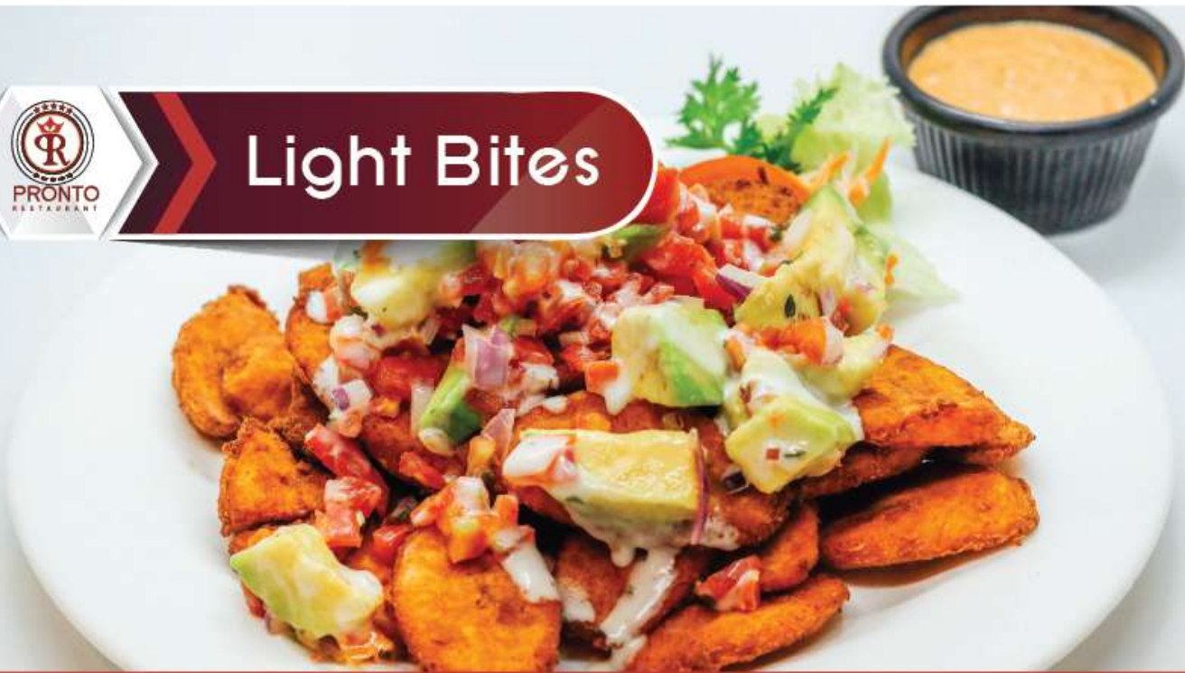
Upgraded plantain 650/-