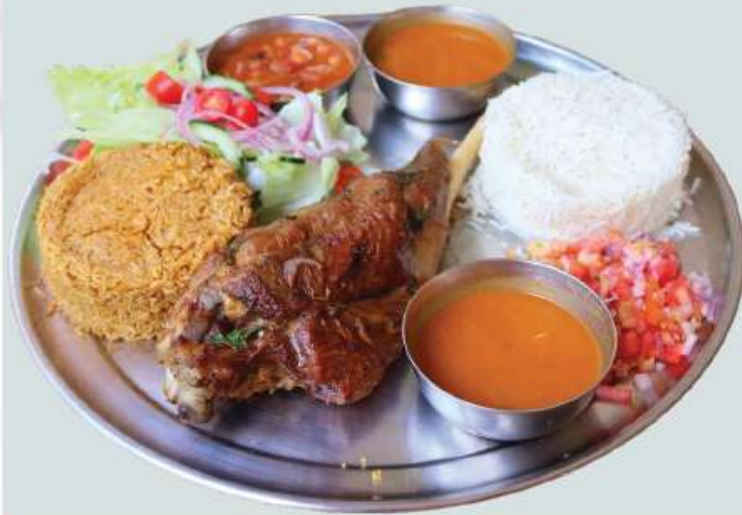
Sinia for 2, with dailo, rice, pilau & beans 1500/-