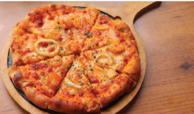
Mixed Sea food Pizza