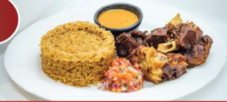
Arosto with pilau 950/-