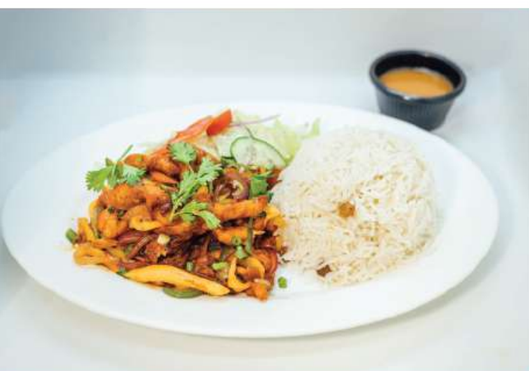
Chicken stir fry 980/- Julienne of chicken sauted with vegetables