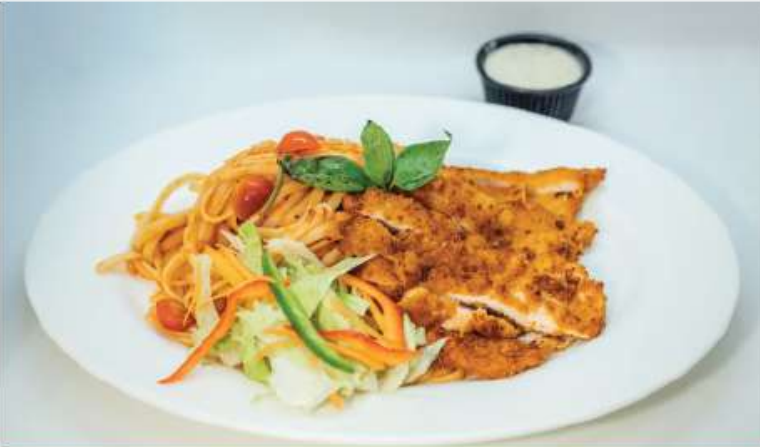
Linguine melanese chicken 980/- Breaded chicken breast. linguine pasta with our special salad in french dressing