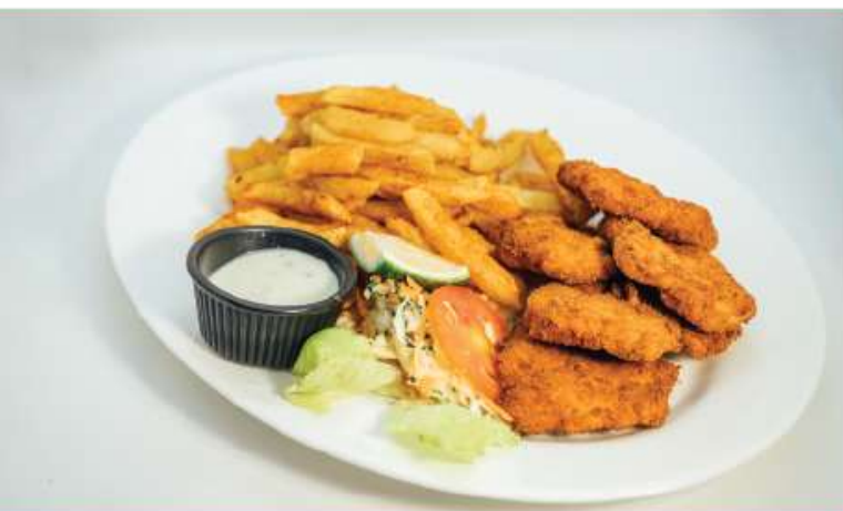
Chicken Nuggets 980/- Breaded chicken pieces. salad. chips and tartar sauce