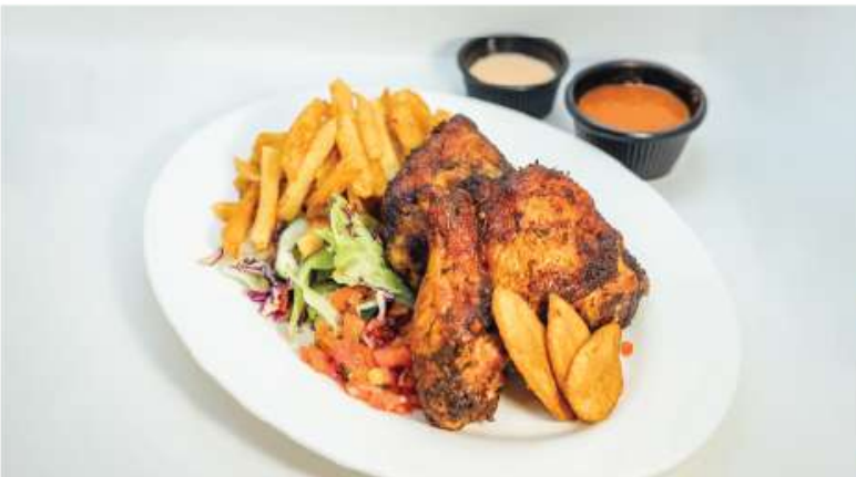
Caribbean royal chicken 1180/=

Roasted chicken lemon & herb periperi marinade, chips, mix vegetables and periperi sauce