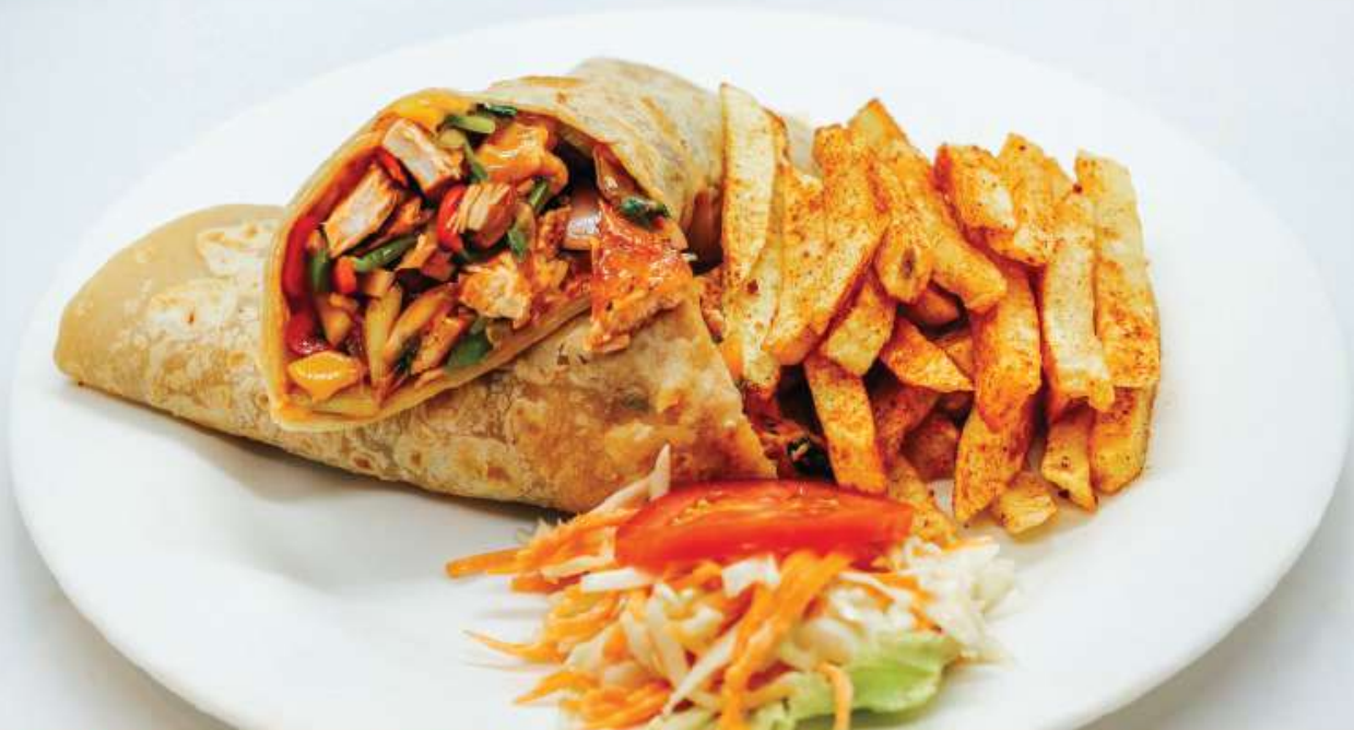
Chicken fajita Wrap 900/- Sauteed chicken with red and yellow peppers, cilantro, carrots, onions, chilli mayo wrapped in a tortilla and served with chips and coleslaw.