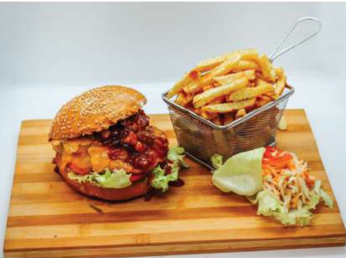
Mexican burger 980/- Chicken/beef, cheddar cheese, green pepper, white onion, tangy salsa, chilli mayo & jalapenos in a bun.