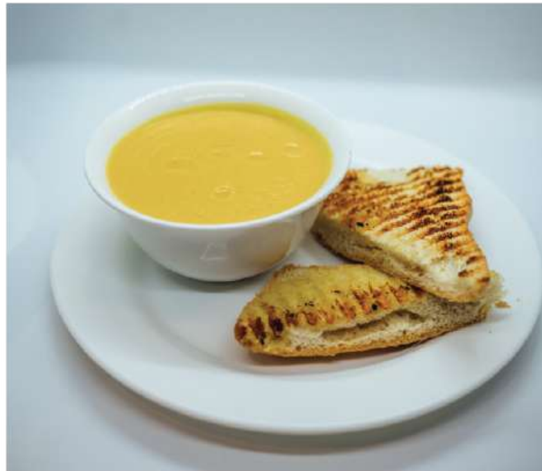
Carrot & Ginger Soup 350/-