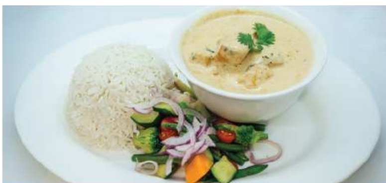
Chicken curry 980/- Chicken cubes in creamy curry sauce