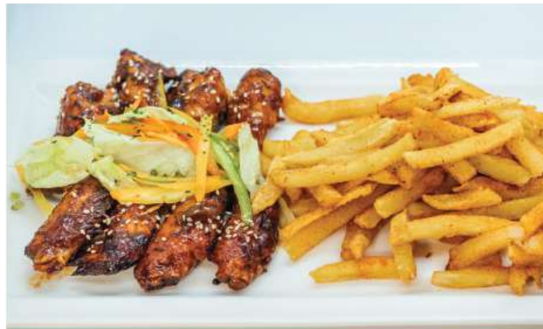
BBQ chicken wings 980/-

Fried bread crumbed chicken with house special marinade.