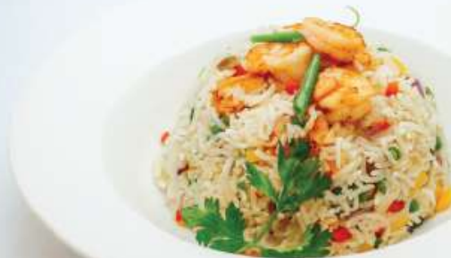
Prawns rice 850/-