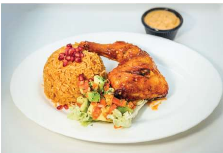
Nasi goreng chicken 980/- Indonesian style roasted chicken in kepat sauce with ketcham manis sauce.