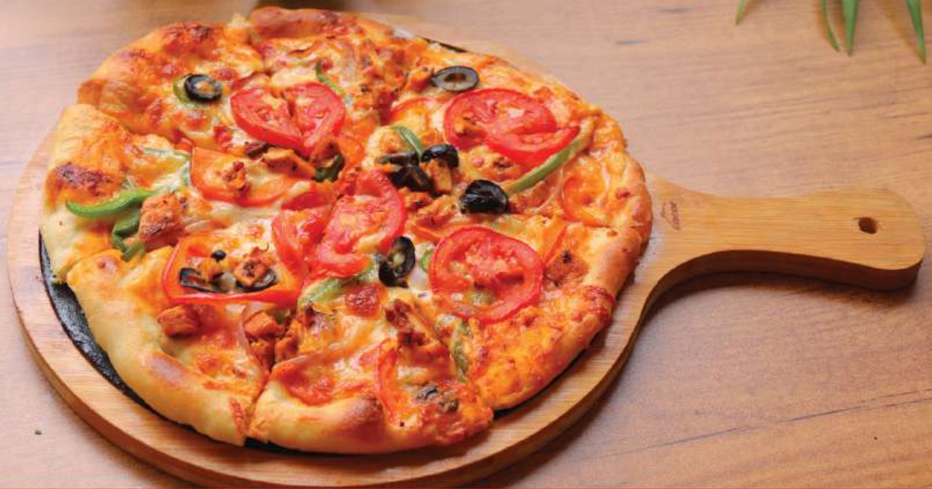
Supreme Chicken Pizza