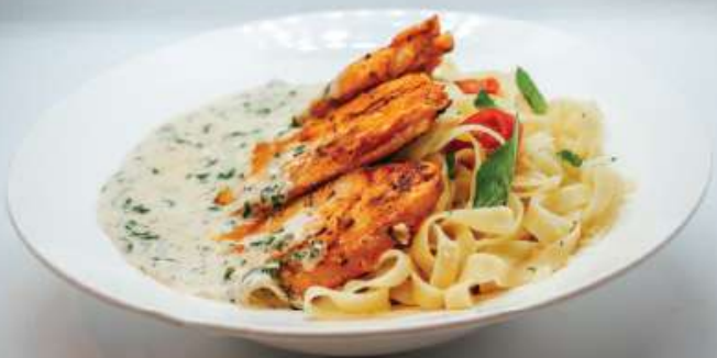
Tuscan chicken pasta 980/= Fettucine pasta with chicken in tuscan sauce with spinach & sun-dried tomato.