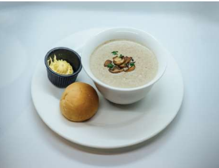
Cream of Mushroom soup 350/-